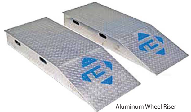
Aluminum Wheel Riser AWR