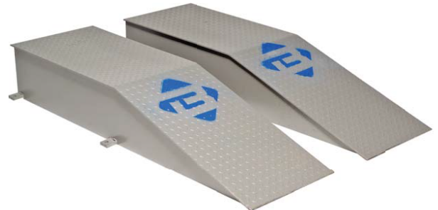
Steel Wheel Riser SWR