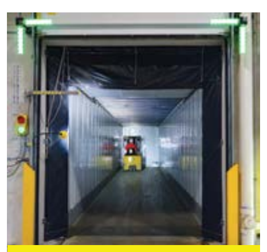
Pair the DL2GN with our DL2IL to maximize safety and productivity!